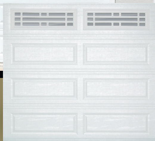
8' x 7' 4240 white with optional mission window inserts

MODEL 2240 Short Panel, Uninsulated MODEL 2241 Short Panel, Insulated MODEL 4240 Long Panel, Uninsulated MODEL 4241 Long Panel, Insulated