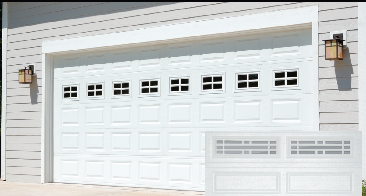
Pictured. 18' x 8' 2241 white with optional stockton window inserts